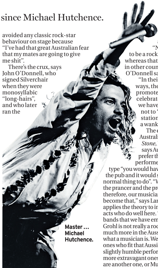
Master ... Michael Hutchence.